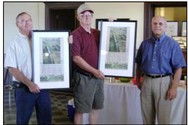
Transportation Museum Live @ 5