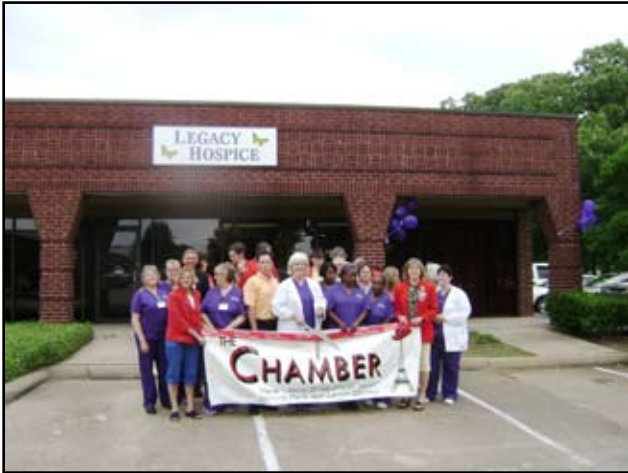
Legacy Hospice Ribbon Cutting