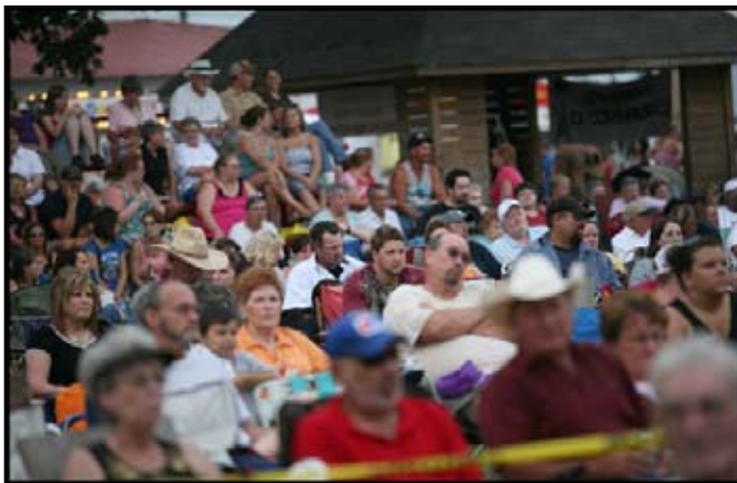
1st Annual Red River Valley Music Festival