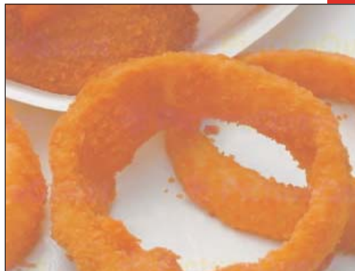
Newcomer Kerry is ready to add a second shift at its Calhoun facility. The coatings manufacturer makes onion ring batter for a national fast food chain. Site requirements included a rail spur for raw materials.

• The city of Buford continues to expand its natural gas system. In 2002, it will add 3,000 new services bringing customers to 20,000, a 15 percent growth over the previous year.