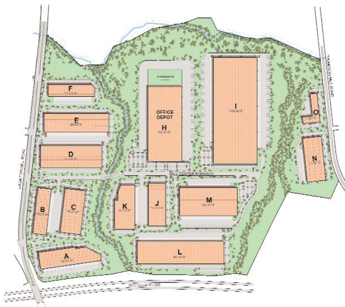
Hamilton Mill Business Center

Calumet Towne Center in Newnan is a 200-acre "walk-to-work" development with condos, patio homes, retail and commercial buildings with 1st phase near completion. It is wired with fiber optics and two of the three office buildings have prospective tenants.