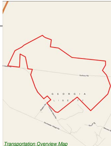
Transportation Overview Map

Capacity & Proximity to Site: 4" Main – On Site