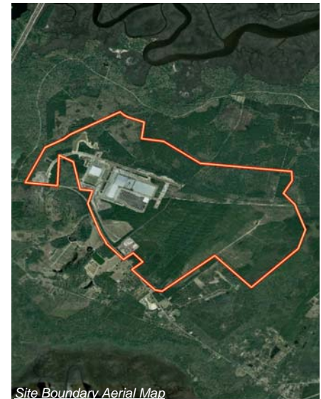
Site Boundary Aerial Map