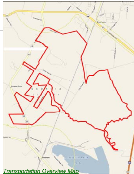
Transportation Overview Map

Capacity & Proximity to Site: 4" Main – 1 Mile From Site