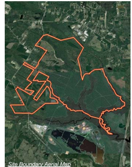
Site Boundary Aerial Map