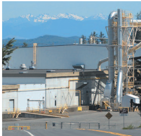
The Olympic Mountains provide a backdrop for the NewWood plant at Satsop.