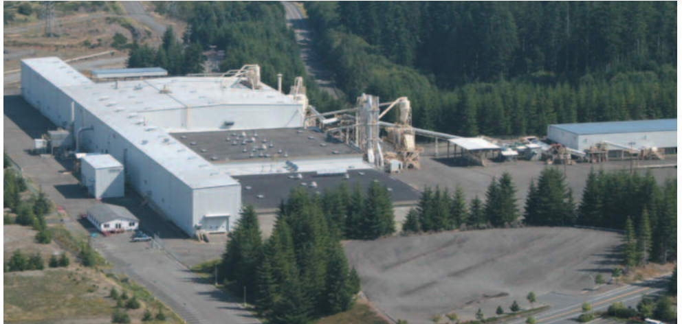
The NewWood facility is a 275,000-square-foot complex on 15 acres at Satsop Development Park.

entrepreneur. He has had success in commercial cabinets, mill work and composite panels as well as exterior wall cladding products for commercial applications.