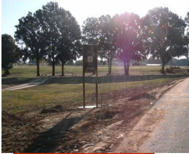
Fitness station along the newly constructed Walking Trail @ Trussell Park.