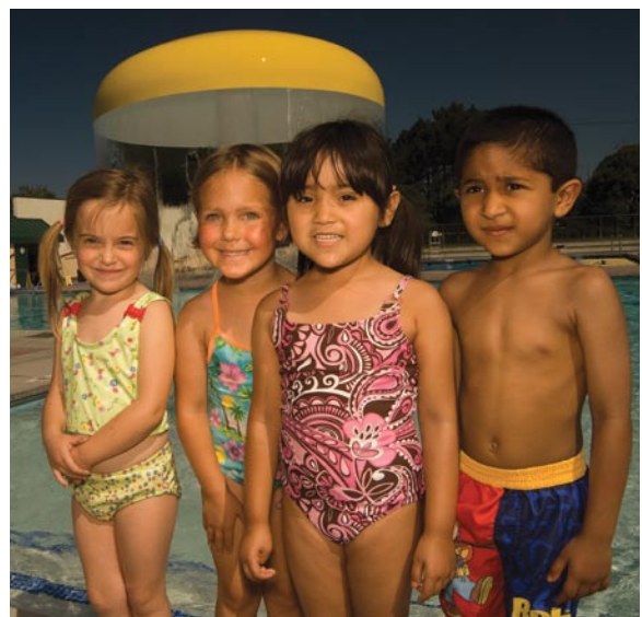
El Cerrito's state-of-the-art Swim Center offers recreation for all ages.