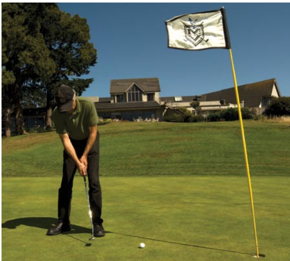
El Cerrito's Mira Vista Golf and Country Club offers golf with spectacular views of the Bay Area.