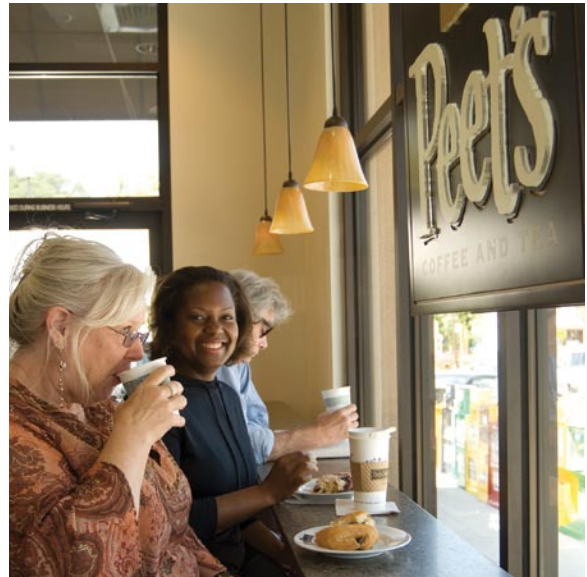
Peet's Coffee is a welcome new business in El Cerrito.