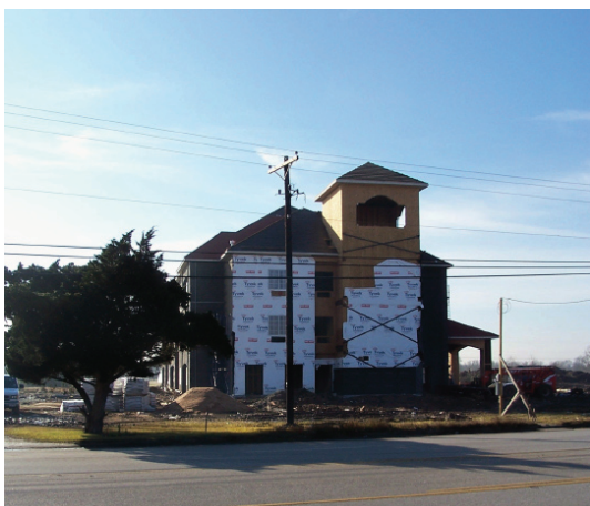
The new La Quinta located on Hwy 35 past Sutherlands is slated to be opened soon.

Matagorda Chamber and TXDOT. A new flood gauge on the Colorado River has been approved and will be put in place the first part of the year.