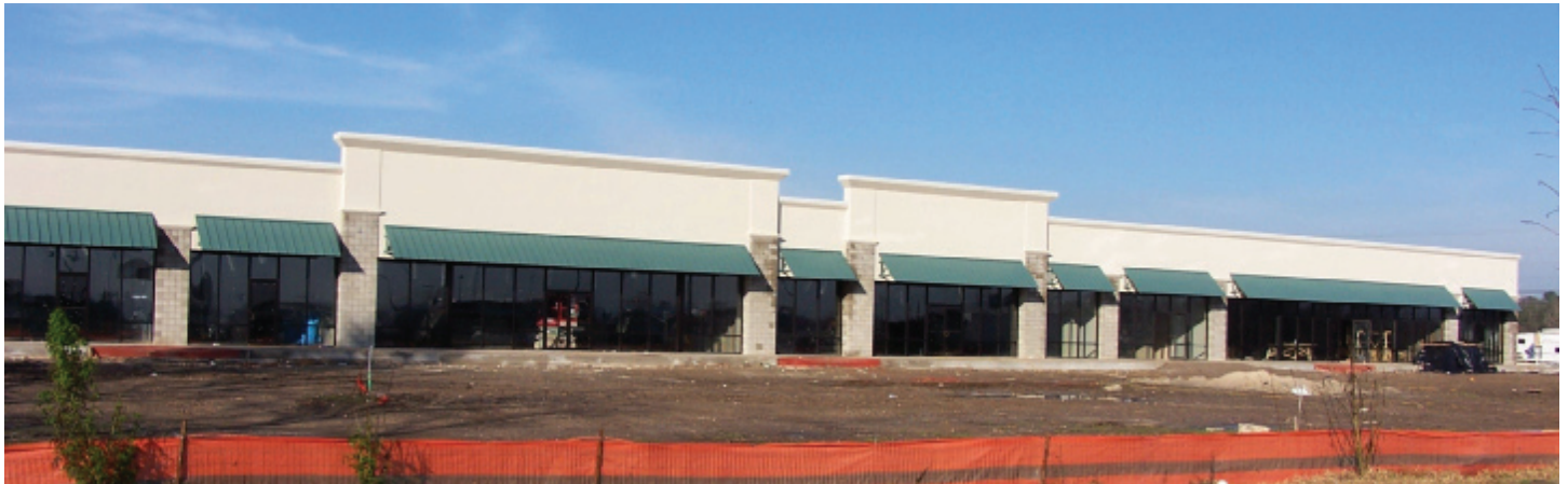
The 23,300 square foot shopping center located next to Wal-Mart will offer CATO (a clothing store for women), Hibbett's Sporting Goods, Sally's Beauty Supply, Fancy Nails and King Buffet with other retail stores to come.

Bay City has seen lots of retail expansion in 2007, with the hopes of seeing much more in 2008. The Super Wal-Mart opened in January with Chili's Bar & Grill and Pizza Hut Wing Street opening soon after; while the Tractor Supply Company made a wise investment by renovating half the old Wal-Mart building. ReMax Bay Area opened a branch in Bay City, along with All Star Real Estate's new building on Seventh Street. The WorkSource and the Business Assistance Center opened their doors to help those seeking jobs and new business ventures. Extended Stay opened giving out-of-towners and business men and women another choice in hotels, as well as the new bed-and-breakfast - Duncan B&B.