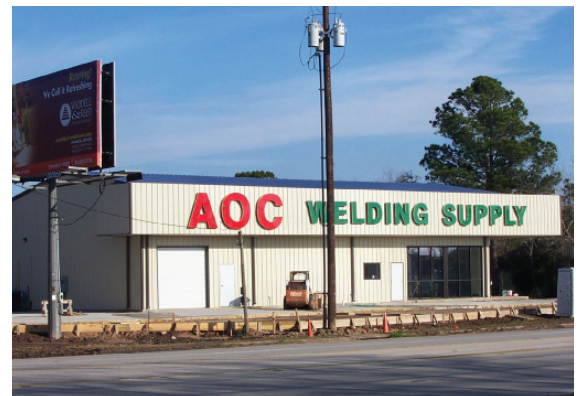
AOC Welding Supply located on Hwy 35 near LaQuinta is also close to being ready for business.

lots already sold. New restaurants include Spoonbills and The Reef. Cattails, an upscale, modern day Mercantile Store featuring artwork, clothing, fine wines, cigars, gourmet foods and coffees is located in the Karankawa Village. You will soon see beautiful Palm trees lining the entrance to Matagorda as a part of a project by the